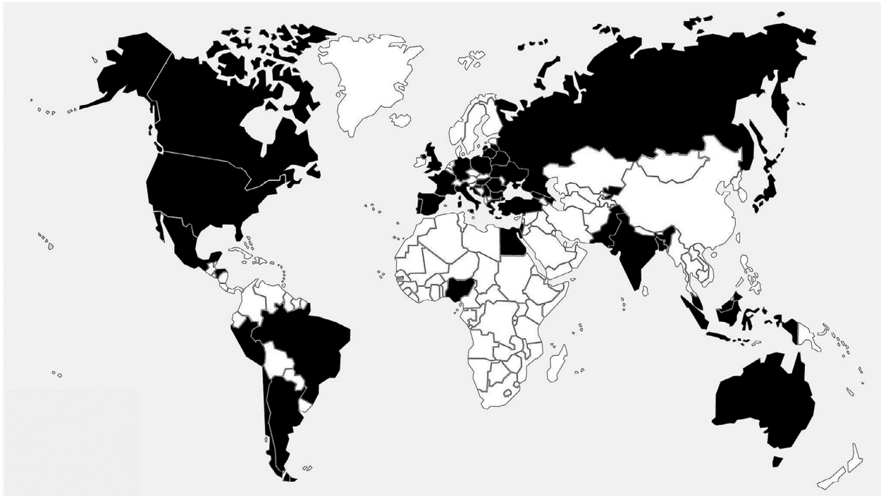
Fig. 1 Map of the 40 participating countries.