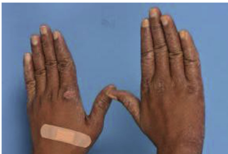
Fig 2. Swelling of the hands.