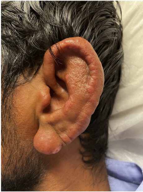
Fig 1. Ear edema.