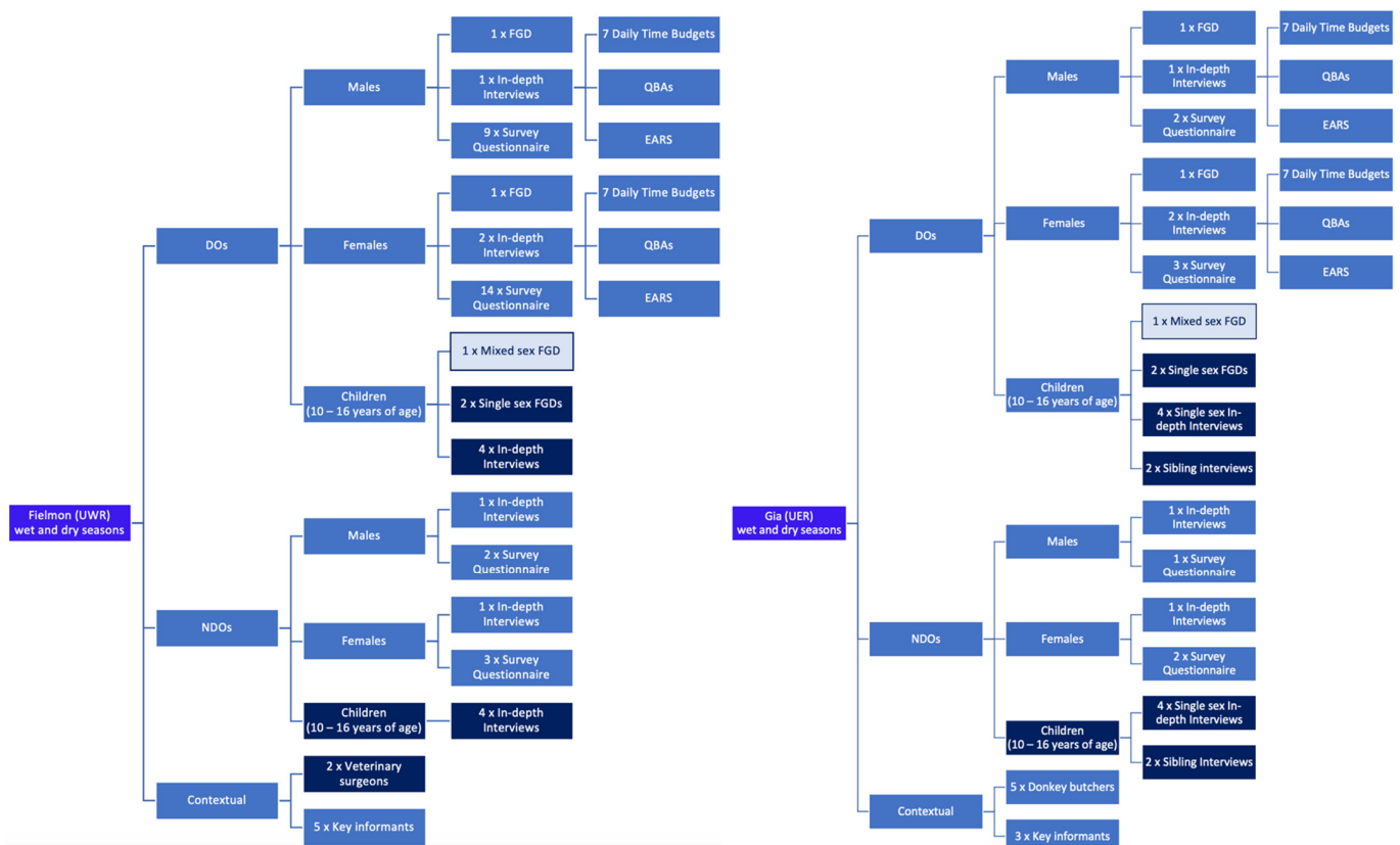
Figure 3. Study Research Instrument Schedule: the number of each research instrument conducted in each study site, with which audience.

Focus group discussions (FGD) and in-depth interviews (INDI) were undertaken with adult and children DOs and NDOs. In addition, a survey questionnaire was undertaken with male and female DOs and NDOs. DO INDI also undertook seven daily time budgets (7DTB), charting their donkeys’ activities each evening for seven consecutive days This data was disaggregated by the age and gender of senior household members, including the eldest children of both sexes. These budgets were completed on seven consecutive evenings in both December 2018 (first visit) and June 2019 (second visit). Unstructured contextual interviews with key informants ( n = 14 ) were held in both study sites (Figure 3).