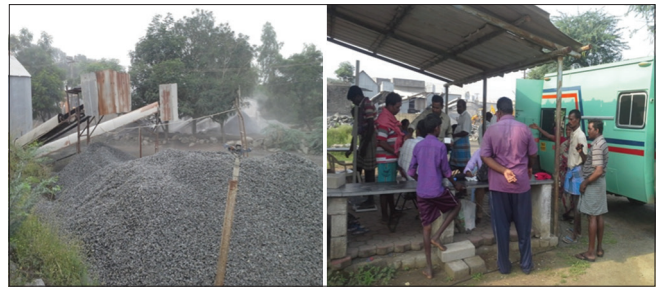
Figure 1: Participating study site and clinical examination

The mean SBP, DBP, and the pulse rate of the quarry workers and residents were within the normal range. However, the FVC and FEV 1 values obtained using spirometer were significantly lower among the quarry workers when compared to that of the residents. About 16.7% of the quarry workers were having cough, 14.6% had breathing problems, 20.6% had respiratory issues, and 17.6% presented abnormal X-ray, the proportion of which was significantly higher ( P < 0.05) when compared to that of the residents [Table 2]. Based on the spirometric analysis, a higher proportion of quarry workers had