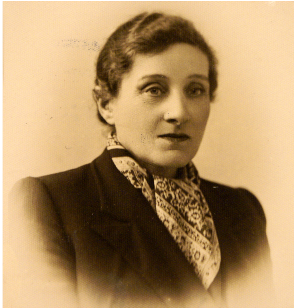
Figure 1. Bronisława Brandla Fejgin (1883–1943).