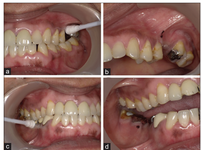
Figure 1: Localization and marking of the TrN lesions. (a and c) Pressure with cotton bud identifying a 3X3mm area on the mucobuccal fold and gingiva. (b and d) Site of the lesions marked with dye

The differential diagnoses of this type of localized reproducible neuropathic pain include trigeminal neuralgia (TN), painful post traumatic trigeminal neuropathy (PTTN), and trigeminal TrN. The clinical features of reproducibility of pain from percussion/local pressure, rather than by light touch (characteristic of TN); and the fact that there was a lack of refractory period, points the diagnosis in the direction of trigeminal TrN. Conceivably, TrN although not officially classified, has similar features described in the literature with those of PTTN.