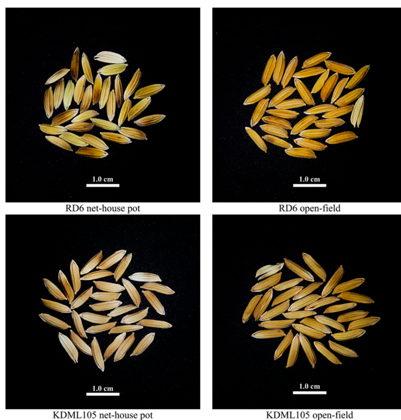
Figure 1. Representation of the grain appearances of two Thai elite rice cultivars grown in the net-house pot and open-field conditions.