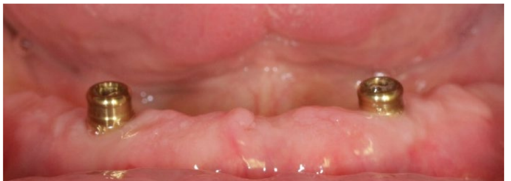
Figure 4. Clinical appearance after placement of prosthetic attachments.

Existing dentures were molded and relined with soft material to not interfere with the peri-implant tissues and reduce occlusal forces on the implants. After six weeks of surgery, early loading was performed. An open impression technique with individualized tray and addition silicone material was used. An Overdent ® (Galimplant, Sarria, Spain) attachment system was used in the manufactured and retention of the overdentures over the osseointegrated implants. (Figures 4 and 5).