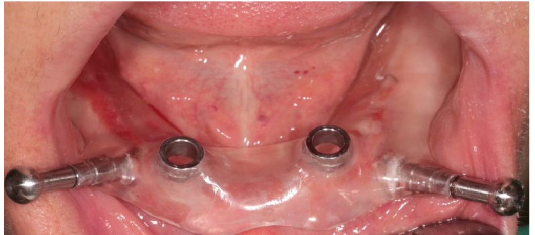
Figure 3. Placement of the surgical splint with the rings that allow the insertion of the implants through a flapless approach.