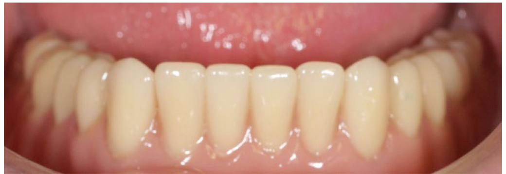
Figure 5. Inserted prosthesis.

Implant stability and absence of peri-implant radiolucency, mucosal suppuration, and pain were considered as survival criteria. All patients were included in a maintenance program consisting of clinical and radiological examination and cleaning of prostheses and implants. The frequency of revisions was set at 3 and 6 months and annually after guided implant insertion. Periapical radiographs acquired digitally using positioners were used to measure follow-up in marginal bone loss. The analyzed variables included patient information (gender, age, dental health, systemic diseases, history of periodontitis, smoking habit), details about the placed implants (type, number, position, diameter, and length), and the implant-supported overdenture including the dates of delivery. In addition, surgical, biological, and technical complications that occurred during implant insertion, postoperatively, or during function in the follow-up period, were recorded.