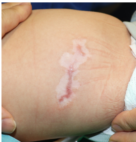
Fig. 4. Follow-up photographic finding after 4 months. The patient continued to follow up for the wound observation and there was no more deposit of calcification since the complete healing.

tient continued to follow up for the wound observation and there was no more deposit of calcification since the complete healing (Fig. 4). The follow-up X-ray showed no more calcification deposit in the flank area.