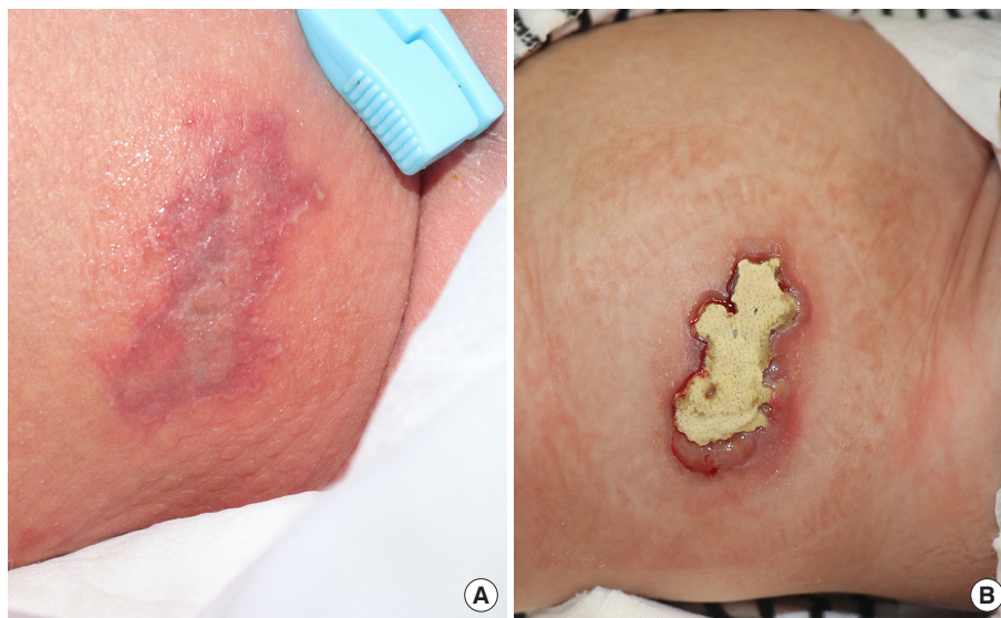
Fig. 1. Initial photographic findings of calcinosis cutis at flank area. (A) The patient had erythema in the flank area and its initial size was 5 × 2 cm. (B) The erythema became firm and changed into whitish crust consist of small crystals.

The wound size diminished day by day with marginal epithelization (Fig. 3C). There was no infection sign during the treatment. After 2 months, the defect was fully covered with healthy normal skin. There was no depression or contracture at the wound site. There was only pigmentation in the scar. The pa-