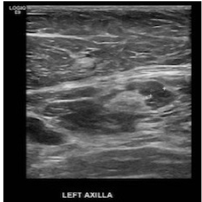
Fig. 2. Case no. 3. A 61 years old female, who had her first and second dose of AstraZeneca vaccine, (79 days) and (one day) prior to examination. Ultrasonography of the left axilla showed two mildly enlarged lymph nodes, one has an eccentrically thickened cortex that measured 4.9 mm. Biopsy confirmed benign reactive changes.

our unit's guidelines or in 4–12 weeks after the second dose of vaccination as per SBI recommendations [3]) to ensure resolution and nodal sampling in case of no resolution.