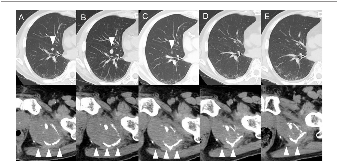
Figure 2. CT scans over the course of treatment with atezolizumab plus bevacizumab.

The upper panels show the right lung and the lower panels show the left ilium. (A) CT images before the initiation of treatment showing metastatic tumors (arrows). (B) CT image after the second course showing an increase in the size of the tumors (arrows). (C) CT image after the third course showing a decrease in size of the tumor (arrows). (D) CT images after the fourth course showing disappearance of the right lung tumor and a decrease in the left iliac tumor (arrows). (E) No recurrence of metastatic lung tumors, and further reduction in the left iliac tumor after the fifth course (arrows).