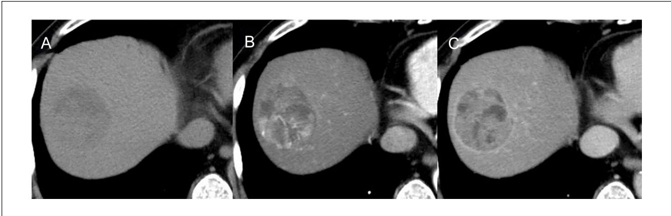
Figure 1. CT images of the tumor.

Plain computed tomography (A) demonstrated a low-density tumor (54 mm in diameter) in the liver S8. The tumor was (B) enhanced in the arterial phase and (C) washed out in the equilibrium phase.