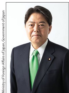
Ministry of Foreign Affairs of Japan, Government of Japan

Nutrition is fundamental for the health and wellbeing of individuals and a basis for sustainable development and economic growth. Investing in good nutrition is an opportunity to positively impact health, increase individual potential and productivity, and support the economic development of nations. The Government of Japan will host the Tokyo Nutrition for Growth Summit 2021 on Dec 7–8. This is the third Nutrition for Growth Summit following London in 2013 and Rio de Janeiro in 2016. The Tokyo Summit aims to review the current status and challenges in nutrition improvement worldwide and to promote global efforts towards better nutrition. At the Tokyo Summit, malnutrition in all its forms will be addressed, including undernutrition, overnutrition, and the double burden of malnutrition, as part of accelerating efforts to achieving global goals and targets, such as the UN Decade of Action on Nutrition (2016–25), the WHO Global Nutrition Targets 2025, and the 2030 Agenda for the Sustainable Development Goals (SDGs).