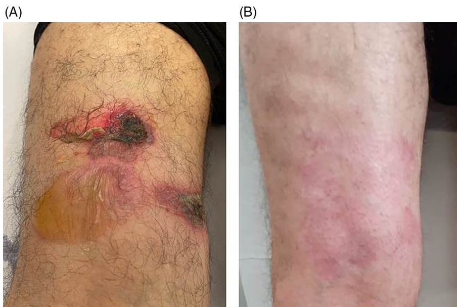
FIGURE 1 Erosions and blisters on the left leg (A); complete resolution after 3 weeks of treatment (B)

misdiagnosed as post-traumatic lesions by his general practitioner. Three days after the second dose of vaccine, which was administered 1 month after the first, the patient started developing new blisters on his limbs and trunk. When he was eventually admitted to our department he presented several erosions and tense bullae on erythematous base measuring 4–11 cm in diameter on trunk and limbs (Figure 1A). Nikolsky sign was absent and the remainder of the physical examination was normal. Blood exams were carried out, including routine clinical chemistry, neoplastic markers, viral hepatitis markers, autoimmunity panel and quantiferon test. All were within normal limits. Tzank test performed from a fresh bulla showed eosinophils. Histopathology from a bullous lesion demonstrated subepidermal blister with occasional lymphocytes and eosinophils. Direct immunofluorescence revealed a linear band of C3 along the basement membrane. A diagnosis of bullous pemphigoid was made and the patient treated with topical steroids and prednisone 30 mg daily (0.5 mg/kg daily 4 ) for 4 weeks, then reduced by 5 mg every week, then stop. A complete resolution of the blisters was obtained after only 3 weeks of treatment (Figure 1B).