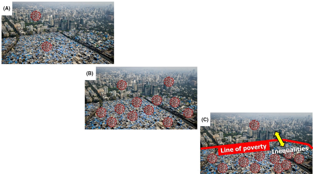
FIGURE 1 Impact of pre-existing social differences on the outcome of COVID-19 pandemic. (A) In a given metropolis, the initial event of pandemic can hit two geographical areas, which segregate intrinsic social, economic, structural, health and medical differences. (B) COVID-19 pandemic has the chance to hit each area in a totally different way and violence since the above-mentioned differences are important predisposing; (C) the consequences of the pandemic will ultimately depend on the underlying capacity of resilience, which is weaker below ‘the line of poverty’. The ultimate outcome of the pandemic (bringing the concept of ‘syndemic’) will increase the burden of inequalities between the two social realities

Source: Mumbai, India (2017), Extreme wealth and opulence exist side by side in India’s financial capital, Mumbai. With permission from J. Miller, Unequal Scenes - Mumbai .