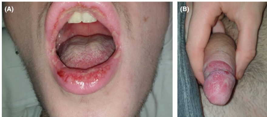
FIGURE 1 (A) Patient 1 with shallow erosions on the vermilion lips and hard palate and surrounding erythema. (B) Periurethral erythema and shallow erosions on the area glans penis and distal shaft