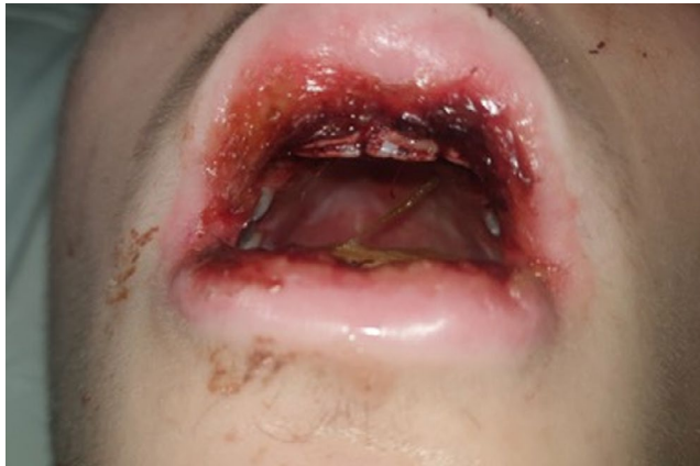
FIGURE 2 Hemorrhagic crusting and extensive erosions involving the lips and hard palate in patient 2