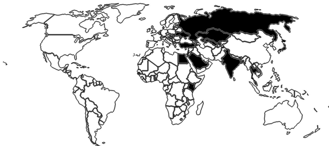
Fig. 1. Geographical distribution of the use of favipiravir.

clinical practice guidelines for COVID-19 proposed by the Turkish Ministry of Health [7], favipiravir was given to patients by the filiation teams. Consisting of three members (physician, health professional, and assistant personnel), the filiation team is responsible for following up each case and visiting households to take history and initiate favipiravir treatment in Turkey [8].