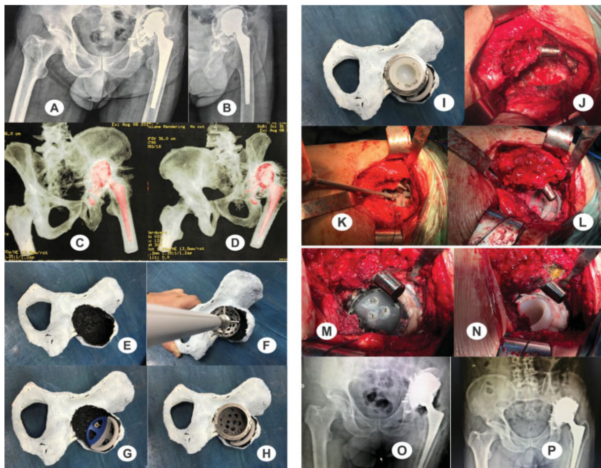
Fig. 2 (A, B) Preoperative radiographs of the pelvis and lateral view of the left hip; (C, D) computed tomography scans; (E) visualization of the extensive acetabular lesion; (F) study of the situation; (G) assembly of a new arrangement with trabeculated metal and study of its anchoring; (H) placement of the new acetabulum; (I) positioning the cemented polyethylene; (J) visualization of the intraoperative lesion (note the virtual absence of the acetabular roof and of the anterior and posterior walls); (K) assembly of the trabeculated metal structure; (L) placement of divergent screws and chopped, impacted bone graft; (M) placement of the trabeculated metal cup after deposition of a thin layer of cement between the metal components to avoid metallic contact; (N) acetabulum cementation at the proper position; (O) immediate postoperative radiograph; and (P) radiograph three years after the procedure (note the graft integration).

present study is not only applicable to orthopedics and traumatology, but to all medical areas.