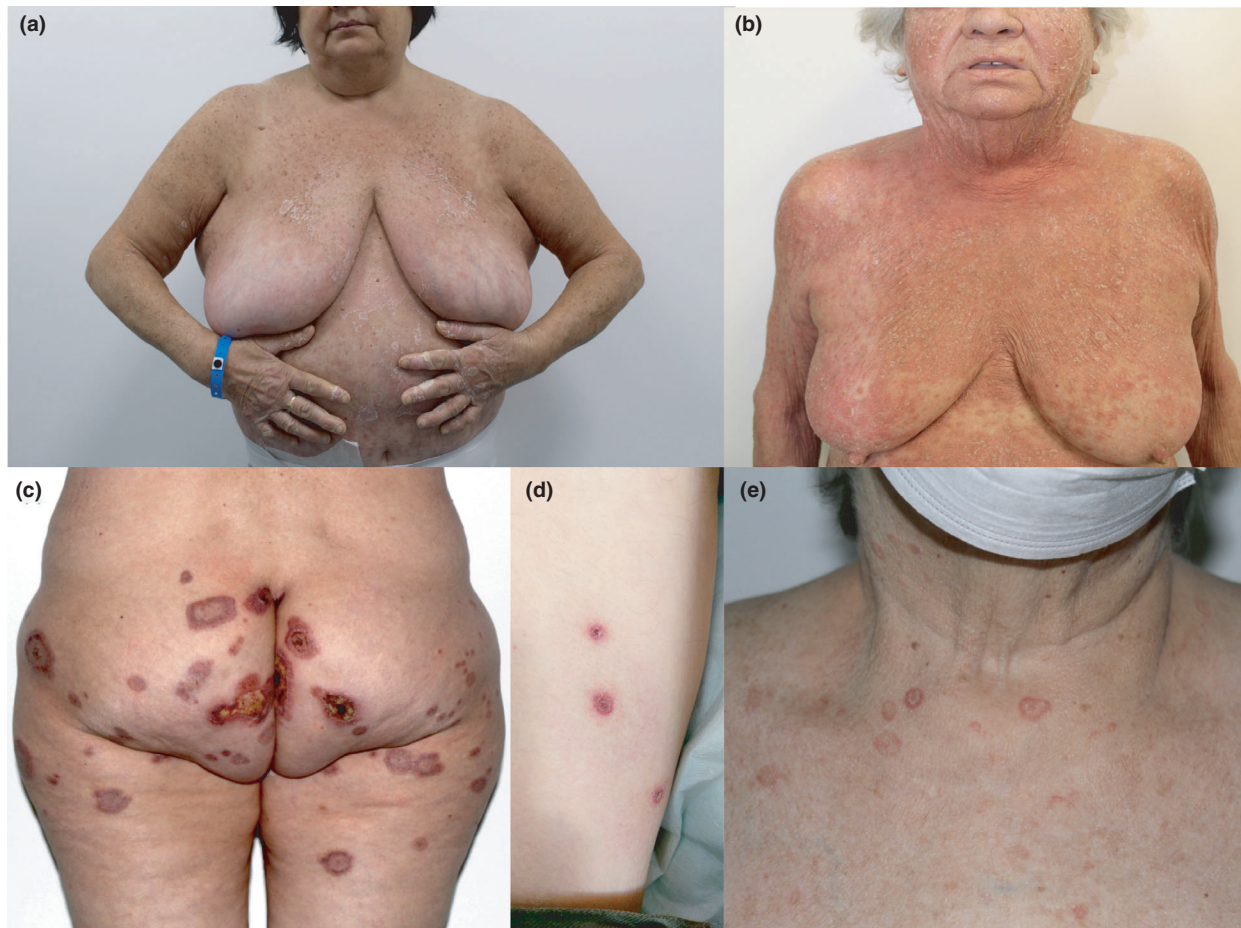
Figure 1 (a–e) Clinical features of the five cases with possible COVID-19 vaccine-related adverse reactions: (a,b) pityriasis rubra pilaris (two patients, both confirmed histologically) manifesting as widespread distributed erythematous patches and concomitant unaffected ‘islands’, resolving with lamellar desquamation; (c) Sweet syndrome, showing evolutive polymorphism of early annular lesions evolving into large, thickened ulcerated plaques; (d) pityriasis lichenoides et varioliformis acuta, manifesting as scattered, nonfolliculocentric, rapidly evolving papules showing erythematous, raised borders and an eroded centre, covered by a haemorrhagic crust; and (e) erythema multiforme, showing noncoalescing target-like lesions mainly distributed on the limbs.

To better characterize the relationship between these possible ARs and vaccine administration, we used the Naranjo Adverse Drug Reaction Probability Scale, 1 obtaining a score for each patient indicating a ‘probable’ causality link (Table 2). All patients had undergone a COVID-19 throat swab test 2 weeks prior to the vaccine, which was negative, and none of them had been infected since the pandemic started. None of the patients had any medical history of previous ARs to drugs or vaccines, or of any dermatological disorders.