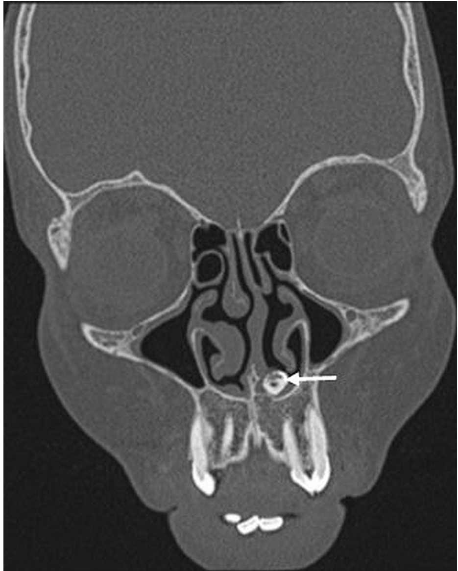
FIGURE 3: Coronal image showing a bone-like structure (white arrow) embedded in the hard palate extending into the left nasal cavity.