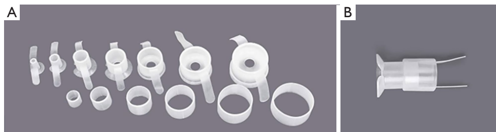
Figure 1 PhimoStop™ device. (A) Standard tuboids (top row) and intermediate tuboids (bottom row). The fins of standard tuboids are fixed outside the prepuce with adhesive patches. (B) Insertion of the intermediate tuboid on the standard one, allowing a gradual increase of the tuboid diameter of half a size.