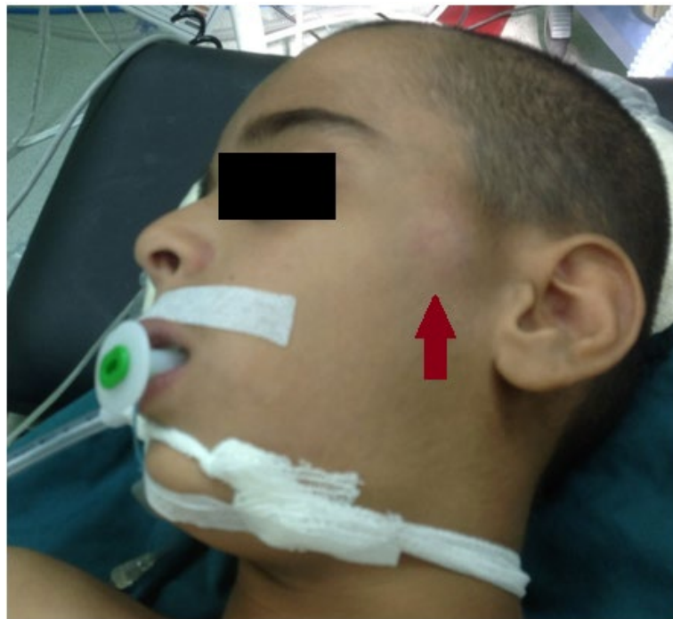
Fig. 1: A 10-year-old boy with a mass on the left periauricular region