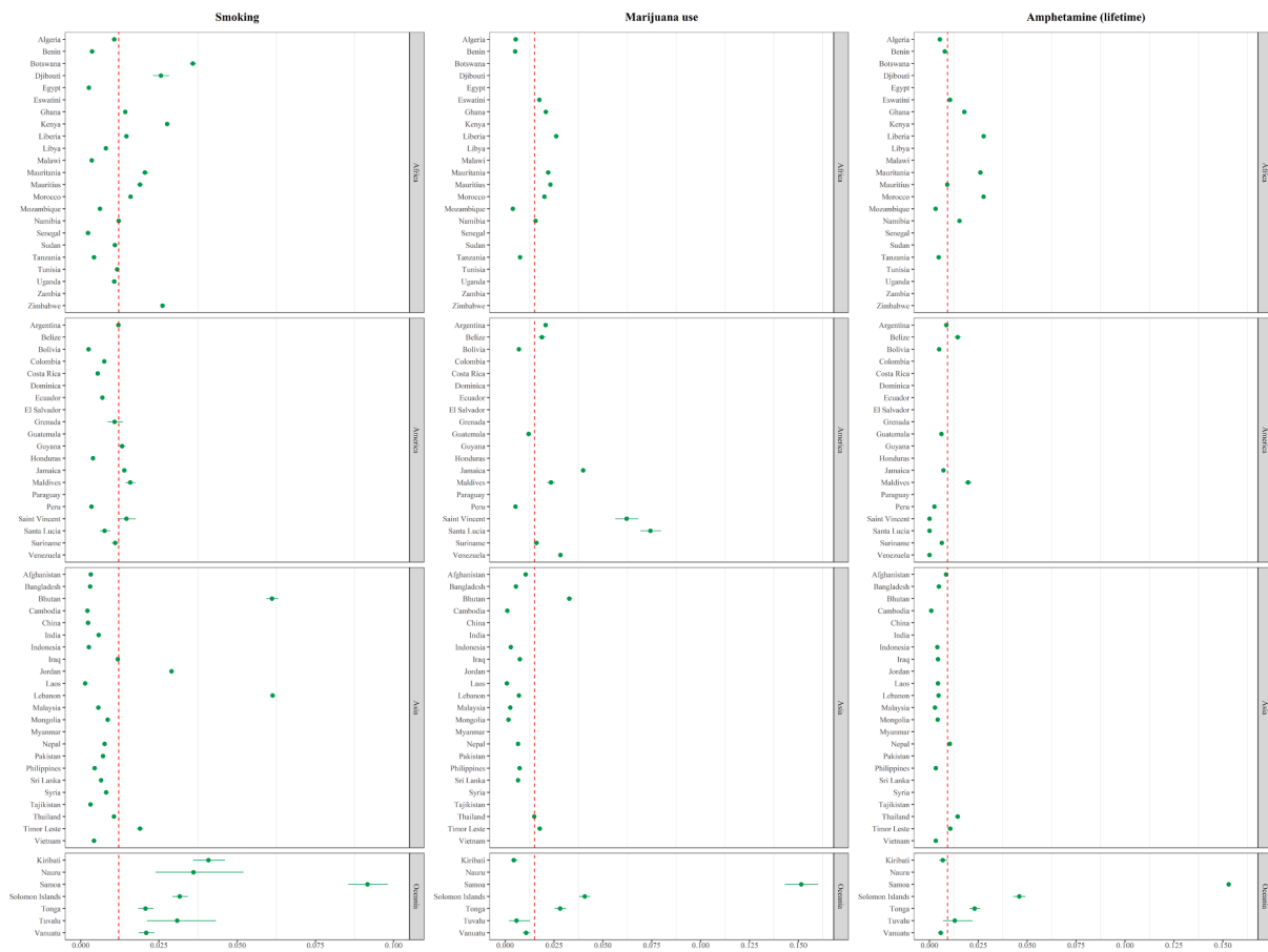
Note. Estimated weighted 30-day prevalence and 95% confidence interval (whiskers) are displayed for smoking and marijuana use. The lifetime prevalence was displayed for the amphetamine outcome. The red dashed line displays the overall prevalence.