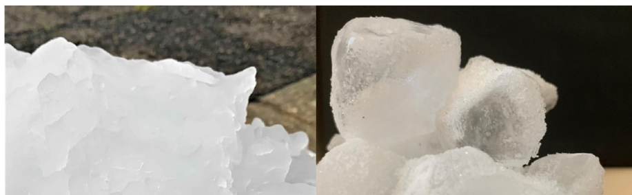
Fig. 1. Liquid ice can be seen on the left side and block ice on the right.

on PS and used it as an index of flexibility as it can objectively and quantitatively assess muscle flexibility. We hypothesized that cryotherapy using LI would have a lower PS compared to that of BI after high-intensity exercise. Moreover, we performed a case series to verify of the effects of cryotherapy.