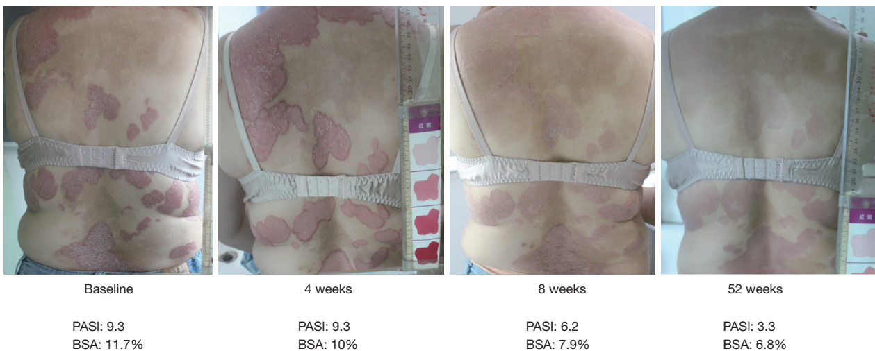
Figure 3 Representative skin images of participants before and after treatment. The four images were skin images of one of the participant before and after treatment. From the images, the erythema, scaling and infiltration of the lesion had improved significantly after treatment. The PASI score declined gradually from baseline (before treatment 9.3) to 52 weeks (3.3) after treatment. And the BSA also decreased (from 11.7% to 6.8%). The participant reached PASI-50 at week 52. BSA, body surface area; PASI, Psoriasis Area and Severity Index.