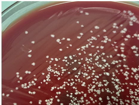
Fig 4. Mycobacterial colonies growing on the blood agar plate used for acid-fast bacilli tissue culture. Mycobacterium chelonae was identified via mass spectrometry.

methods in NTM infections. One study showed that in patients with positive AFB cultures, only 15% and 34.2% had positive AFB smears and Fite stains, respectively. 2 This low sensitivity was also evidenced in our patient, whose AFB and Fite stains were negative on the initial biopsy. In the presence of reasonable clinical suspicion, an AFB culture should be strongly considered, even when stains are negative.