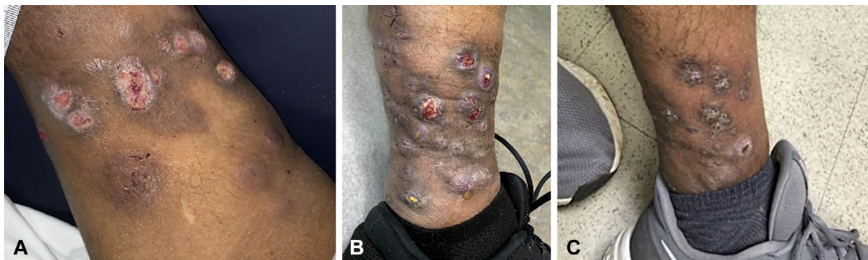
Fig 1. Cutaneous Mycobacterium chelonae infection. A , Initial clinical presentation showing violaceous, friable, ulcerated nodules scattered on the left medial lower extremity. B , Clinical image taken at 2-month follow-up showing worsening of lesions. There are multiple, grouped, erythematous nodules on the left medial lower extremity with ulceration, purulent crusting, and sinus tract formation. C , Improvement of patient's lesions seen after 3 months of combined antibiotic therapy with tobramycin, linezolid, and azithromycin.