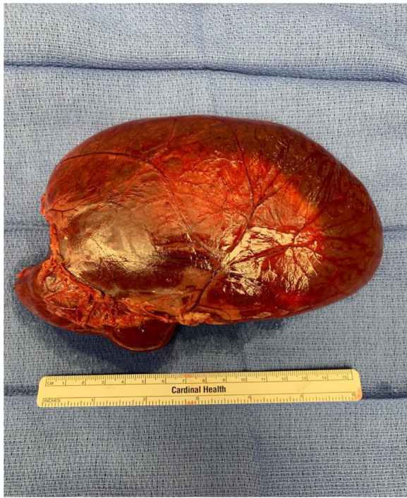
Fig. 3 After careful separation from the tail of the pancreas, the cyst was removed intact and sent to pathology