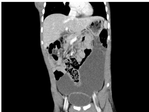
Fig. 1 Computed tomography of the abdomen demonstrated a 7.3 \times 11.7 \times 14.9 -cm cystic mass originating from the greater curve of the stomach and reaching the dome of the bladder

The patient was admitted to the pediatric surgery service. The following day, the patient was taken to the operating room for exploratory laparotomy. Upon entering the peritoneal cavity a large thin-walled cyst was apparent, occupying the majority of the lower hemiabdomen. The cyst contained serous fluid and appeared to be multilocular. There were multiple solid components floating within the cystic fluid, all several centimeters in length. The cyst was carefully elevated out of the abdomen and traced to its origin in the lesser sac. The thin walls of the cyst necessitated careful handling to avoid rupture. The inferior and lateral borders of the cyst were continuous with the omentum, and the cyst was separated from the omentum using electrocautery and a LigaSure device (Medtronic, Minneapolis, Minnesota). The superior-most attachment of the cyst was then explored (Fig. 2). It appeared that the cyst was arising from the confluence of the transverse mesocolon and the inferior aspect of the tail of the pancreas. It was not clear if the cyst was in communication with the pancreatic ductal system, so the LigaSure device was jettisoned and meticulous sharp dissection was employed to free