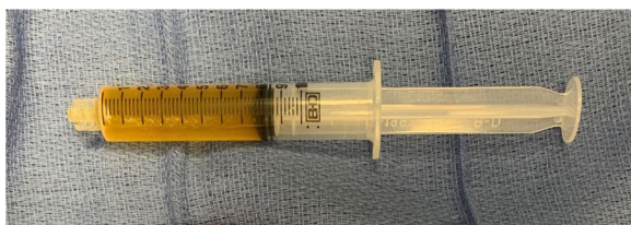
Fig. 4 Serous fluid aspirated from cyst

Omental and mesenteric cysts are rare entities, differentiated by the location in which they occur, with a reported incidence of one in twenty thousand admissions to a children's hospital [1]. The majority of these cysts occur in children, with children under five years old accounting for 75% of cases in certain series [2]. Omental cysts are the rarer of the two, comprising between 14% and 21% of cysts of gastrointestinal origin, based on data from case series [3, 4]. A purported mechanism for the development of a primary omental cyst is the abnormal fusion of the omental bursa's ventral and dorsal lamellae [5]. These cysts have been categorized based on their histologic characteristics. In a system proposed by de Perrot, omental/mesenteric cysts have been categorized into subgroups—lymphatic, mesothelial, enteric,