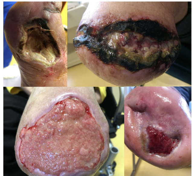
FIGURE 1 Presenting ulcerations in patients qualified for larvae therapy

To model the probability of presence/absence of certain bacteria before and after the treatment, logistic regression was used, which adopts a logistic function to model a binary (“0/1”, “yes/no”, etc.) response based on a linear combination of one or more independent