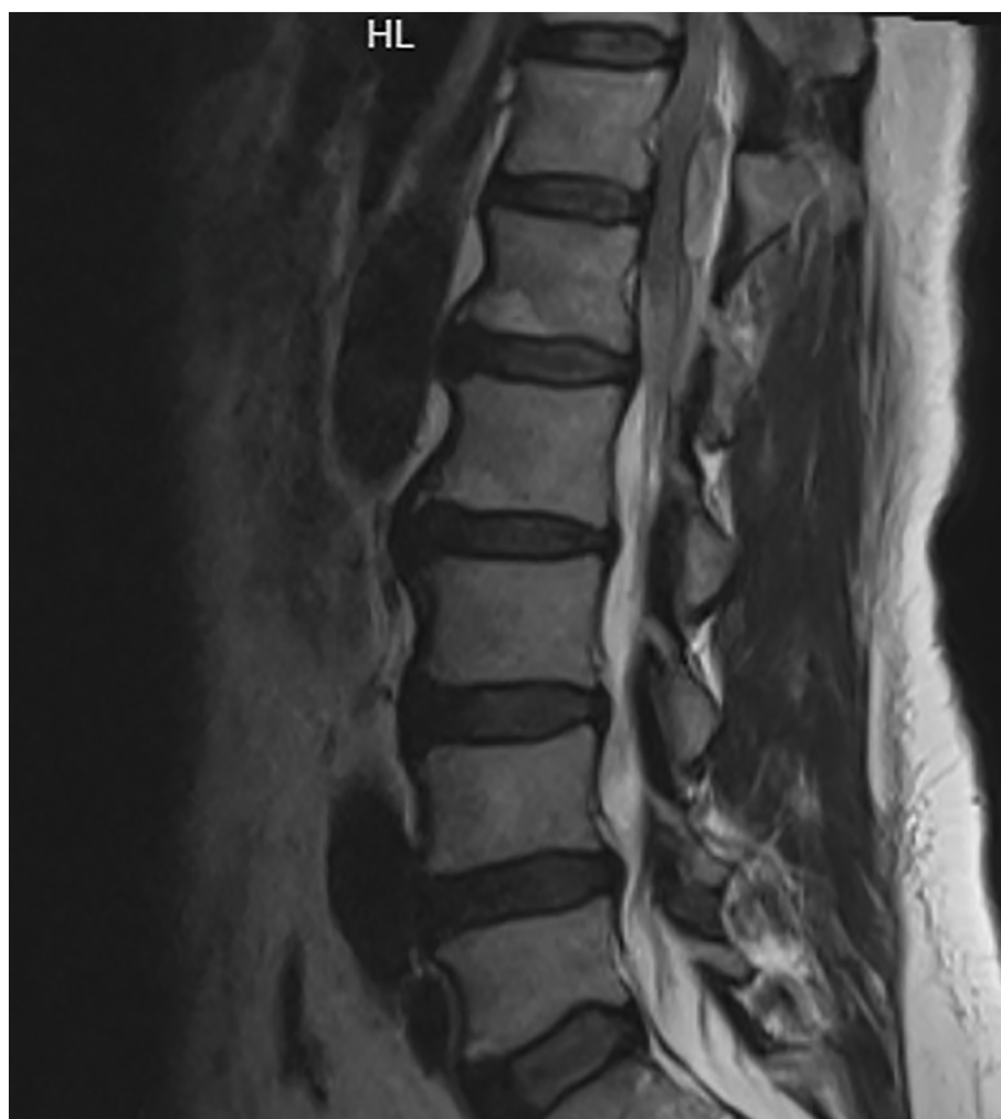
Fig. 3. Pre-operative sagittal MRI image of the mass lesion.

In the pre-operative examinations, the patient's INR was 1.14. When the infection parameters were evaluated, the white blood cell was found to be 7.3 \times 10^3/\mu\text{l} , and the C-reactive protein was found to be in the normal range of 4.9 mg/L. The advantages and disadvantages of conservative and surgical treatment were explained to the patient and the decision to operate was taken and the patient was operated on by Z.O. After laminectomy, the epidural hematoma was encountered and evacuated. There was no other situation that would cause doubt in the surgical observation (Fig. 4). After the intervention, the patient's deficit improved and her pain decreased. In the post-operative period, the patient adapted to the recommended treatments such as wound care and rest. Hematology consultation was made for possible hematological diseases. Additional hematological studies and peripheral smear were performed and a hematological disease was not considered. As a result of pathology, no malignancy was detected, it was compatible with hematoma.