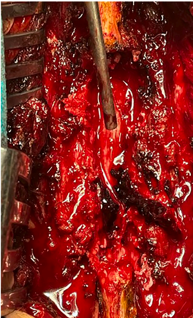
Fig. 4. Intra-operative view of epidural hematoma.