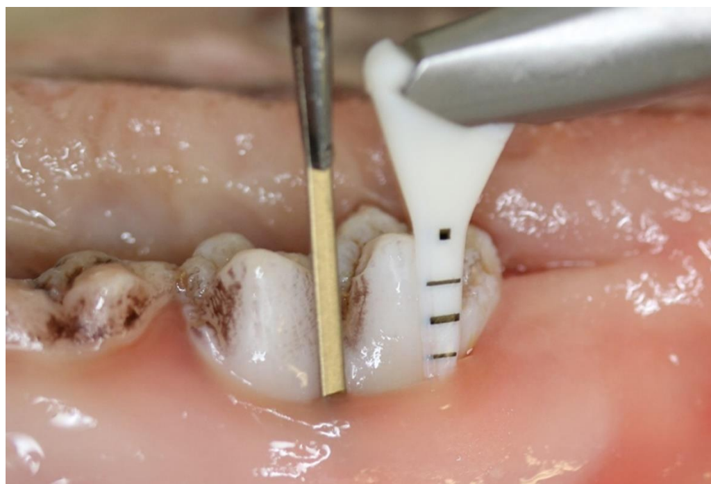
Figure 1. Instrumentation, with both the air-polishing nozzle ( right ; black markings correspond to the nozzle scale) and the biofilm-coated titanium bar ( left ) inserted into the subgingival pocket.

For the purpose of this study, fourteen lower porcine jaws were obtained immediately after slaughter (slaughterhouse waste). Fifty-six subgingival pockets were prepared, and the lower 5 mm of flat titanium bars (1.5 mm wide and 2.5 cm long) were inoculated with an artificial biofilm before being subsequently inserted into the pockets and treated in accordance with their group assignment with a subgingival air-polishing device (Air-Flow Hany Perio, EMS, Nyon, Switzerland) and the corresponding subgingival nozzle (Figure 1).