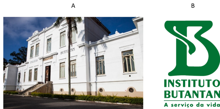
Figure 2. (A) A recent photograph of the main-laboratory building, in a similar framing as depicted in Figure 1. (B) Current Institute logotype, bearing the slogan ‘A serviço da vida’ (at the service of life, in free translation).