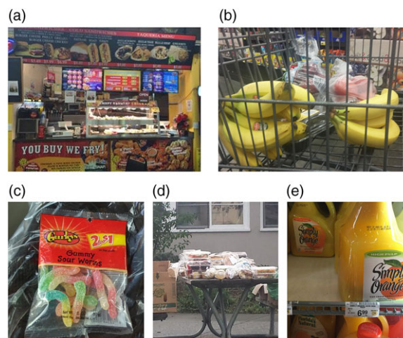
Fig. 1 (colour online) Photos depicting the theme of the food environment promoting unhealthy eating: (a) a fast-food outlet inside a large grocery store, (b) 'caged' by the prices of fruits and vegetables, (c) two-for-$1 deal for candy, (d) a pile of baked goods being given away at a food distribution and (e) the high price of orange juice steering parents towards unhealthy alternatives

Parents described multiple aspects of their food environment that promoted unhealthy eating behaviours. Photos were taken from a variety of food outlets (e.g. fast-food restaurant, grocery store, convenience store, local food distribution site) and described the messaging, pricing and excessive availability of unhealthy foods that constantly encouraged unhealthy eating. In Fig. 1(a), the photo depicts a fast-food outlet inside a large grocery store with