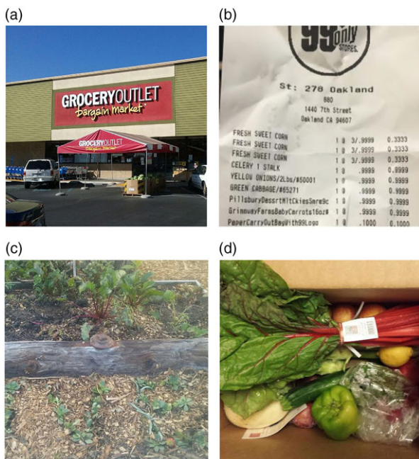
Fig. 2 (colour online) Photos depicting the theme of the creative strategies employed by parents to acquire food with limited resources: (a) one of two Grocery Outlet stores a parent visited that day, (b) shopping for affordable food at the dollar store and (c) an organic garden started by a parent, (d) a produce box from Imperfect Foods

have, usually the other one has'. In addition to low-cost grocery stores, parents frequently shopped at dollar stores for 'cheap groceries', including boxed macaroni and cheese and sports drinks (Fig. 2(b)). The mother who took a photo of her receipt said, 'We didn't have much money, so hot dogs were a dollar and buns were a dollar at the dollar store. A couple dollar meal'.