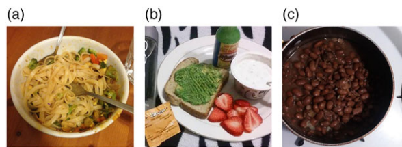
Fig. 3 (colour online) Photos depicting the theme of psychological distress due to food insecurity: (a) Pad Thai from a frozen entrée, (b) a healthy meal after substantial effort which took an emotional toll on the parent and (c) beans and rice to last until the end of the month

Parents expressed feelings of shame, guilt and distress resulting from their experience of food insecurity. These emotions often resulted from having to eat foods that were considered low-quality or cheap, such as ramen noodles, sugary breakfast cereals, hot dogs and frozen meals. As shown in Fig. 3(a), one parent said, 'Today, I had to eat a frozen pad thai because we didn't have a good dinner