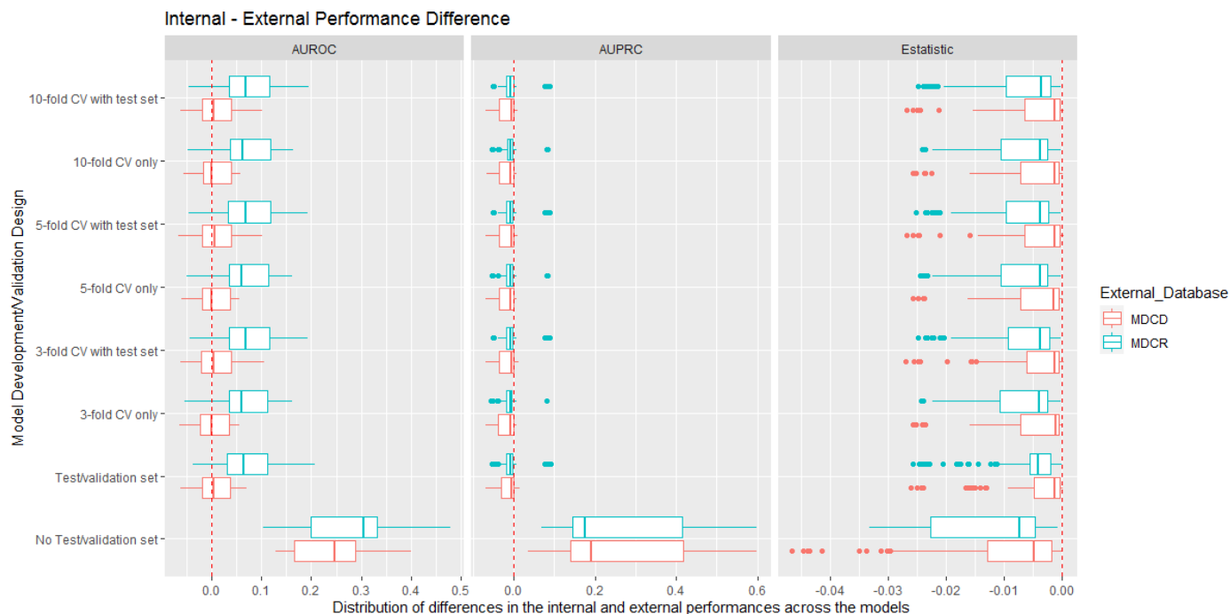
Figure 3 Box plots showing the internal performance estimate minus the external performance estimate per design and external database. The left side shows the AUROC differences, the centre shows the AUPRC differences, and the right side shows the E-statistic differences. For the AUROC, values near 0 indicate that the internal validation AUROC estimates were accurate as the external validation AUROCs were similar. For AUPRC and AUPRC values less than 0 indicate that the performance was better externally, values greater than 0 indicate the performance is worse externally. For the E-statistic, values less than 0 indicate worse calibration when the models were externally validated. AUPRC, area under the precision recall curve; AUROC, area under the receiver operating curve; CV, cross-validation; MDCD, Multi-state Medicaid Database; MDCR, Medicare Supplemental Database.

internal performance estimate bias. In this study using big n (500 000) and big p (>86 000) data to develop LASSO logistic regression models we show that the impact of design has negligible impact if some fair validation process is implemented to select the optimal hyperparameter and some fair process is implemented to estimate the internal performances. The only design in this study that resulted in highly biased internal performance estimates was the ‘no test/validation’ design that leads to overfit models even with big data. The estimated performance of any prognostic model that is developed using the ‘no test/validation’ design cannot be trusted, and this design should be avoided.