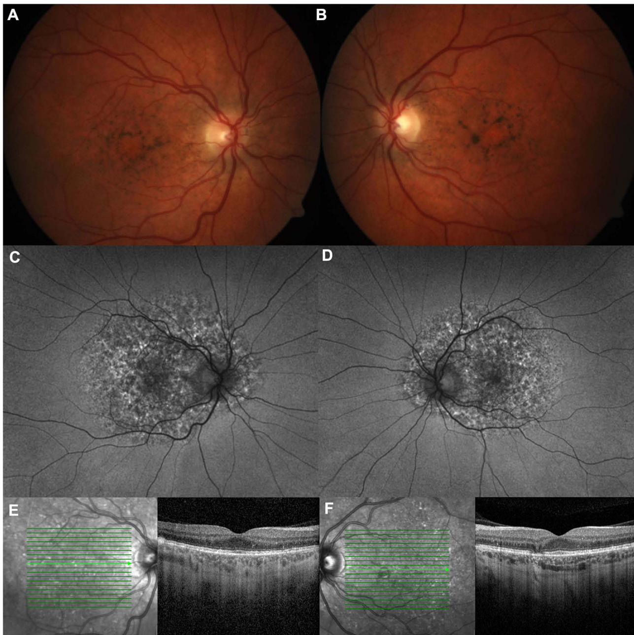
Figure 2 PPS-associated retinopathy.

Notes: The patient is a 49 year old female with no family history of macular degeneration whose RPE mottling extends beyond the macula. She was on PPS for 8 years with a total cumulative dose of 1130g. She was heterozygous for variants of uncertain significance in CACNA2D4 , PRPF8 , and WHRN on genetic testing. On fundus photos of the left ( A ) and right eyes ( B ), she has hyperpigmentation and subretinal yellow deposits. On wide-field fundus autofluorescence ( C and D ), the hyper and hypoautofluorescent spots extend outside the macula. On optical coherence tomography ( E and F ), there is focal RPE thickening with hyperreflectance on near infrared images and atrophy.