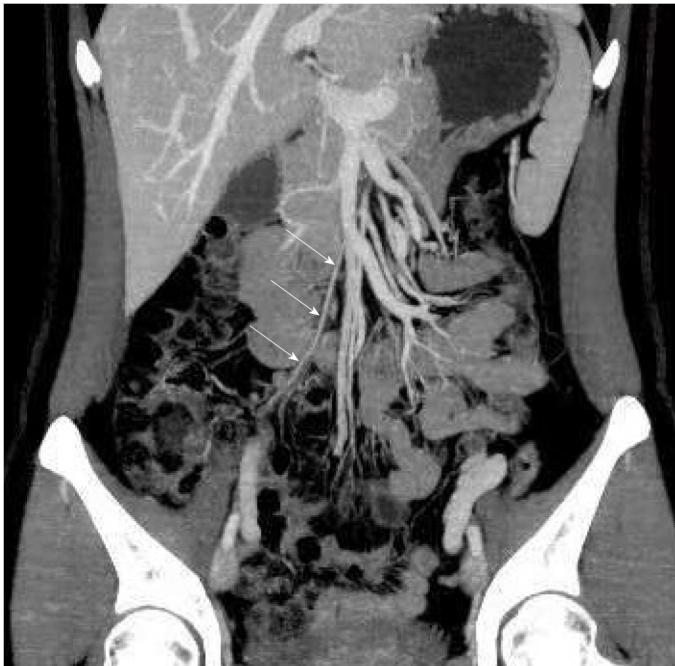
Figure 2 Follow-up computed tomography scan after 1 mo. Coronal reformatted image with maximum intensity projection showed the ileocolic artery (arrow). The site of previous thrombophlebitis in the ileocolic vein had disappeared, which indicated that the vein was completely occluded and that collateral circulation was established.

early stage will lead to delayed treatment and cause severe sequelae, especially in cases of MVT complicated with other acute abdominal diseases. Laboratory tests are usually not helpful for a definitive diagnosis, as the usual finding is an increased white blood cell count, which is not specific. Some patients can exhibit acidosis and increased blood lactic acid, which generally suggests a late stage[7-9]. In recent decades, contrast-enhanced CT has gradually become the preferred test in the diagnosis of ischemic bowel disease. Ischemic bowel disease has been increasingly recognized with