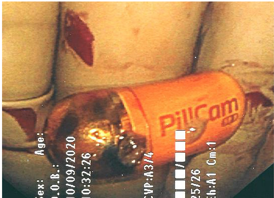
FIGURE 2: Video capsule endoscope retrieved intraoperatively