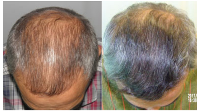
Fig. 10 Results of using topical minoxidil and oral finasteride.