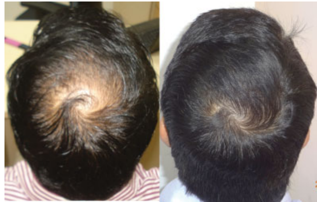
Fig. 11 Results of using topical minoxidil and oral finasteride.

in the transplanted and surrounding areas. Improvement of these hairs not only stabilizes hair loss progression but also augments hair transplant outcomes. This approach goes a long way in optimizing donor supply over patient's lifetime and increasing the interval between two transplants. 9,10,60,61 When planning a transplant, it is important to put these considerations across to the patient and emphasize the benefits of a holistic approach (→Fig. 12).