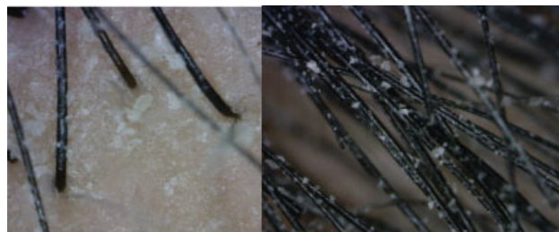
Fig. 7 Minoxidil crystal precipitation on hair