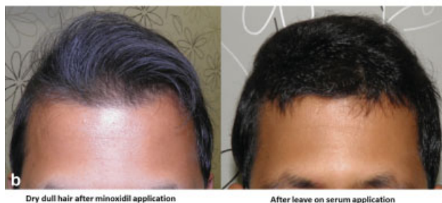
Fig. 8 (a) Dull look after minoxidil application. (b) Addressing dull look after minoxidil application with leave on serum.