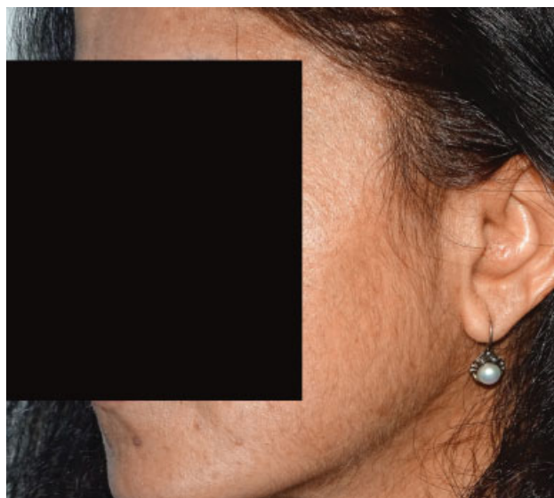
Fig. 6 Increase in facial hair after minoxidil application.