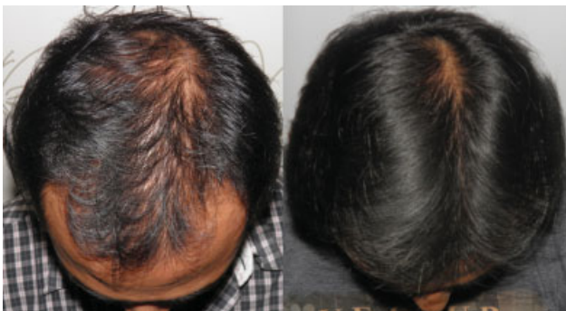
Fig. 9 Results of using topical minoxidil and oral finasteride.

The authors have routinely used a combination of topical minoxidil and oral finasteride as an adjunct to hair transplant surgery to tackle the dynamic and static aspects of MPHL. When used preoperatively (at least 12–16 weeks), it helps to improve yield by prolonging anagen and also helps to reduce postoperative telogen effluvium. When used postoperatively, medications help to improve the vellus hair present