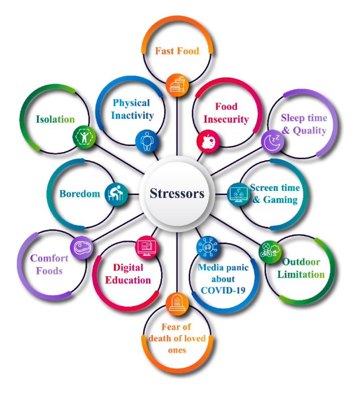
Fig. 1. Stressors affecting psychological health during COVID-19 pandemic.

In addition, increased screen exposure in children and teenagers may increase the risk of attention deficit hyperactivity disorder, anxiety, sadness, and suicidal behavior. The results of an epidemiological online cross-sectional survey conducted in the United Kingdom (UK) during the COVID-19 outbreak also indicated a connection between daily screen use and depression (Lee Smith et al., 2020). Individuals with massively increased screen time should be monitored for the extent of social isolation, sleep patterns and dietary behavior. According to the findings of a Canadian survey with over 4500 participants performed in spring 2020, reducing the amount of time spent watching television, surfing the internet, or playing video games while confinement may improve mental and overall health (Colley, Bushnik, & Langlois, 2020). Sleep might be negatively influenced by the short wavelength-enriched light emitted by technological gadgets. Sleep is a key component of the operation of the immune system. Sleep appears to be an important part of the immune system's function. Immunity and sleep are connected in a bidirectional way; although immune system activity can affect sleep, sleep has an impact on the adaptive and innate immune systems (Lange & Nakamura, 2020). These stressors predominantly affect the dietary pattern due to excessive snacking and an unhealthy selection of foods.