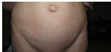
Fig 3. Diffuse hyperpigmented and hypopigmented macules with a mottled appearance over the abdomen.

Hair, nail, and mucosa were all spared. The remainder of the physical examination was unremarkable (Fig 3).