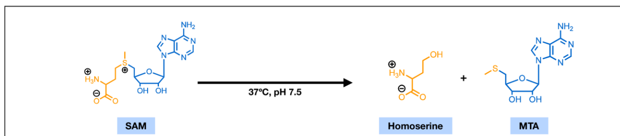
Figure 1: The chemical structures of S-adenosylmethionine (SAM) and 5'-methylthioadenosine (MTA). With features of an amino acid (yellow) and a ribose nucleotide (blue), SAM is highly polar. Under physiological conditions, SAM can undergo a non-enzymatic cleavage reaction and degrade into homoserine and MTA.

Synthesized from methionine and ATP, SAM is highly polar (Figure 1). This polar nature presents challenges for its passive diffusion across biological membranes. Cellular uptake studies of SAM in hepatocytes have revealed a low level of cellular accumulation with a ratio of intracellular to extracellular SAM concentration of 0.19 \mu\text{M} : 1 \mu\text{M} at equilibrium [14]. Additional studies performed in an intestinal epithelial model have reported that the apparent permeability coefficient of SAM (0.6x10 -6 to 0.7x10 -6 cm/s) is much lower than the typical value for passive diffusion [14], and suggested that the main mode of SAM transport is paracellular transport, by which molecules primarily travel through the tight junction. These findings are echoed by the likely absence of SAM transporters in the plasma membrane of mammalian cells. Past studies have successfully identified SAM transporters in the plasma membrane of yeast (SAM3) [15], and in the inner membranes of human mitochondria (SAMC) [16]. However, the lack of