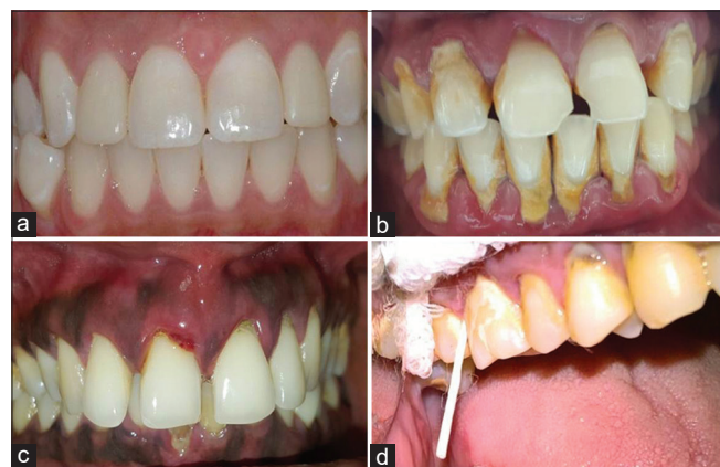
Figure 1: Representation of the various clinical specimens involved in the study. (a) Healthy periodontium, (b) chronic periodontitis, (c) aggressive periodontitis, and (d) sample collection using paper points

Sixty systemically healthy individuals visiting the Department of Periodontics underwent a comprehensive periodontal examination that included probing depth (PD) and level of clinical attachment (CAL). The subjects were assigned into three groups: periodontally healthy (Group A), aggressive periodontitis (Group B), and chronic periodontitis (Group C) [AAP 1999] based on the following inclusion criteria: group A-Clinically healthy gingiva without bleeding on probing, CAL and PD \leq 3 mm [Figure 1a], Group B-aggressive periodontitis, at least four sites showing \geq 3 mm CAL and PD \geq 5 mm including rapid attachment loss and bone destruction, radiographically visible vertical or arc-shaped bone loss, particularly in central incisors and first molars, amount of destruction does not commensurate with local factors [Figure 1c] and Group C-Chronic periodontitis, at least four sites showing \geq 3 mm CAL and probing pocket depth (PPD) \geq 5 mm, amount of destruction