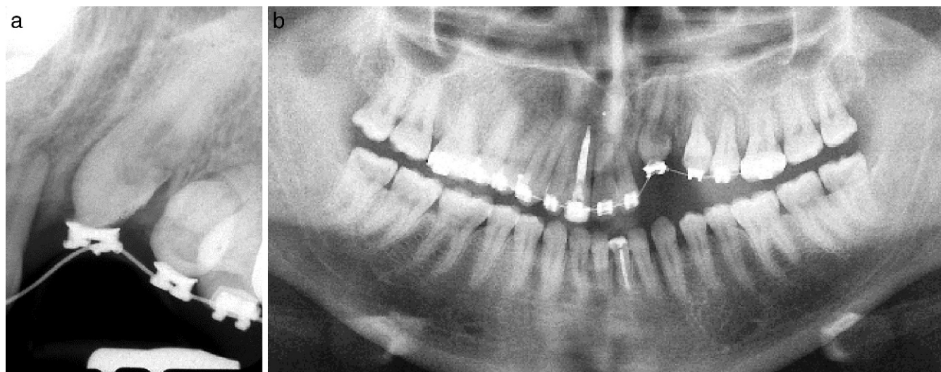
Figure 1. (A) Periapical and (B) panoramic views of a failed impacted canine, showing a distal cervical lesion that has mushroomed inward and extended into the crown.

advanced stages. Thus, extensive dentinal destruction can occur in the complete absence of untoward symptoms. 7