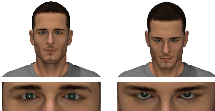
Figure 1. Neutral head angle (left) and downward-head tilt (right) stimuli, with the whole head visible (top), and the upper face visible with the rest of the face and head occluded (bottom). Stimuli were generated using Smith Micro 32 Poser Pro computer software.

full-body images featuring targets with an expansive bodily posture with their hands on the hips, their heads tilted downward, and neutral facial expressions 31 and (b) Mayangna participants reliably recognized body-only expressions of anger, fear, and sadness (see 30 ).