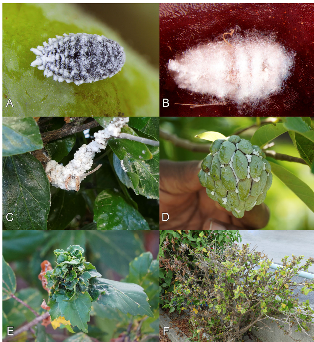
Figure 1: Maconellicoccus hirsutus : (A) adult female; (B) adult female covered in waxy filaments; (C) large infestation on hibiscus; (D) ovisacs in the crevices of Annona fruit; (E) distorted growth characteristic of plants infested by M. hirsutus ; (F) hibiscus plant in Rhodes, severely damaged by M. hirsutus