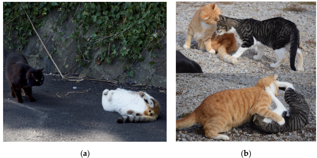
Figure 1. Photos of FRC social interactions taken by K. Vitale: (a) a social roll is displayed from one FRC to another; (b top) a male tabby cat rubs his head against an orange male as a greeting; (b bottom) interaction continues into play and full contact social play is seen between the dyad.

involved in play. Play behaviors may resemble aggression (e.g., biting or cuffing), but they can be distinguished as they are not done to their full extent and they are often preceded or followed by affiliative behavior (Figure 1b, discussed further below). In all, behavioral categories are not always clear-cut but can be clarified by examining the context in which they occurred.