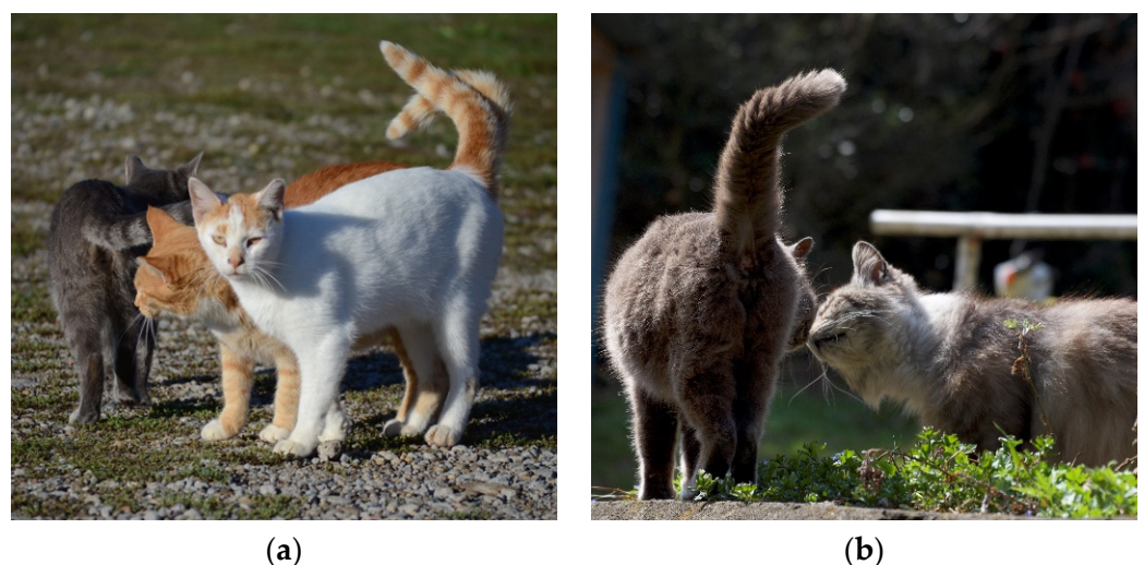
Figure 2. Cont.

The literature search produced a total of 31 relevant results that were included in the review. Papers were sorted into similar categories. Results indicate the existence of two main areas of research, interactions among FRCs (Intraspecific Interactions, 28 papers) and interactions between FRCs and other species, such as humans and wildlife (Interspecific Interactions, 3 papers). Papers within each area were sorted by behavioral category. In cases where a behavior crossed into multiple categories it was placed in the most relevant category based on the paper's focus and the context of the behavior, as discussed above. The 31 papers are presented in Supplementary Tables S1 and S2 with information on the study location, the behavior(s) measured or observed, and the citation. Photos of social behaviors explored in the literature can be seen in Figures 2 and 3.