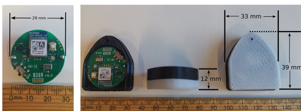
Figure 1. Sensor and casing dimensions.

The primary outcome measure in this study was falls rate, calculated as the number of falls divided by the number of participant bed days in the participating wards during the control and intervention blocks, and expressed as falls per 1000 participant bed