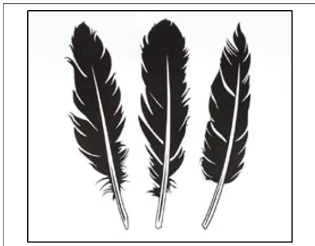
Figure 2. Feathers symbolizing sharing circle theme.

prosperity on these lands we now share”—Truth and Reconciliation 2015. 13