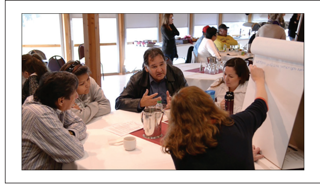
Figure 1. Photograph provided with consent, showing a group session at the Wanuskewin Event.

The KHCP held several Nisohkamâtowak events at Wanuskewin, Meadow Lake, and La Ronge, in partnership with the SHA, First Nations Improvement Team members, and Elders. These events were guided by a holistic participatory framework honoring Indigenous protocols, traditions, culture, and spirituality. The events were advertised using posters and brochures. Patients and their families were invited to attend. Those that chose to attend, signed an SHA media consent and release form. Sharing circles embraced conversational methods/storytelling to gather knowledge and wisdom regarding patient and family experiences living with kidney disease. Videos/short stories were gathered to promote a better understanding of cultural competency,