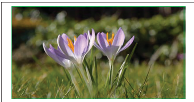
Figure 3. Wahpee Kwanees “Little Flower.”