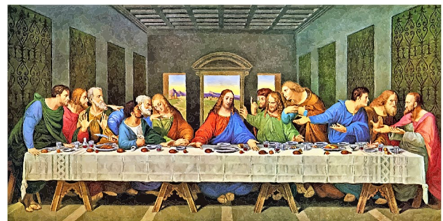
Fig. 2 “The Last Supper” by Leonardo da Vinci, circa 1492. Located in the refectory of the Convent of Santa Maria Delle Grazie, Milan, Italy. Materials used: Fresco painting by mixing pigments into wet plaster to create a permanent bond

Art enabled the discovery of rheumatic disease characteristics prior to them being defined as pathological entities. Rheumatologists incorporated and utilized art as a method of diagnosis and medical education long before modern medicine [8]. Hence, as discussed, several pieces of art have been identified from the Middle Ages, the Renaissance, the Baroque and the Post-Impressionist periods regarding rheumatic diseases [9]. Moreover, several pieces by artists such