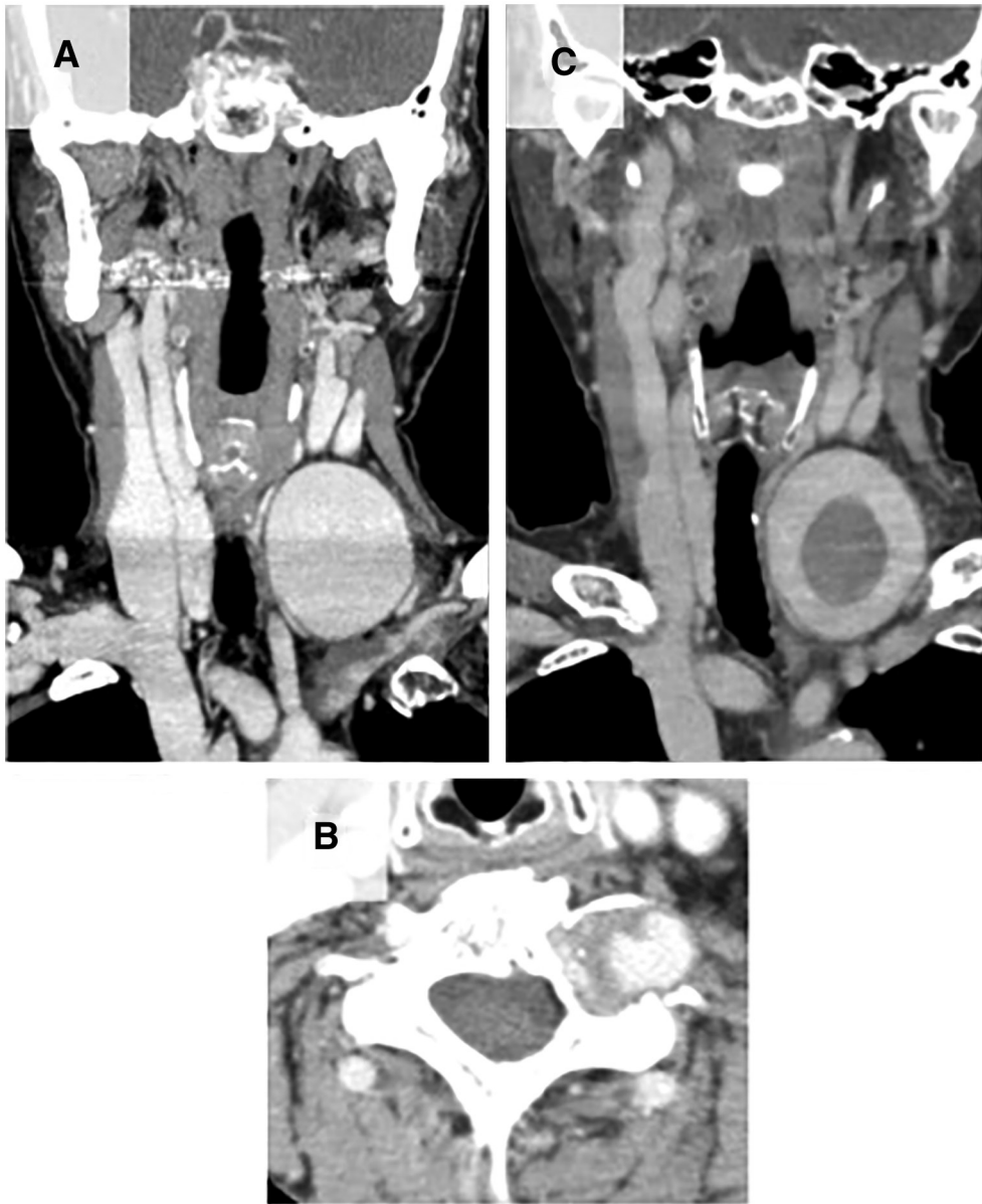
Fig. 1 Initial coronal CTA (A) showing a giant aneurysm of the V1 segment of the left vertebral artery. Axial CTA (B) showing bone erosion in the transverse foramen of the cervical vertebra. Repeated coronal CTA 10 days later (C) showing a thrombosed giant aneurysm of the left V1. CTA: computed tomography angiography.

left anterior neck. On physical and neurological examination, a painless pulsatile mass was found in the left anterior neck, and no neurological deficit was found. She had no serological abnormalities including white blood cell (WBC) count and C-reactive protein (CRP). Her blood coagulation tests showed mildly elevated D-dimer (1.6 \mu\text{g}/\text{mL} ) and normal fibrinogen levels (354 mg/dL). Computed tomography angiography (CTA) showed a giant aneurysm measuring 47 \times 58 \times 47 \text{ mm}^3 in the left neck (Fig. 1A). CT showed bone erosion of the left transverse foramen at the C6 level (Fig. 1B).