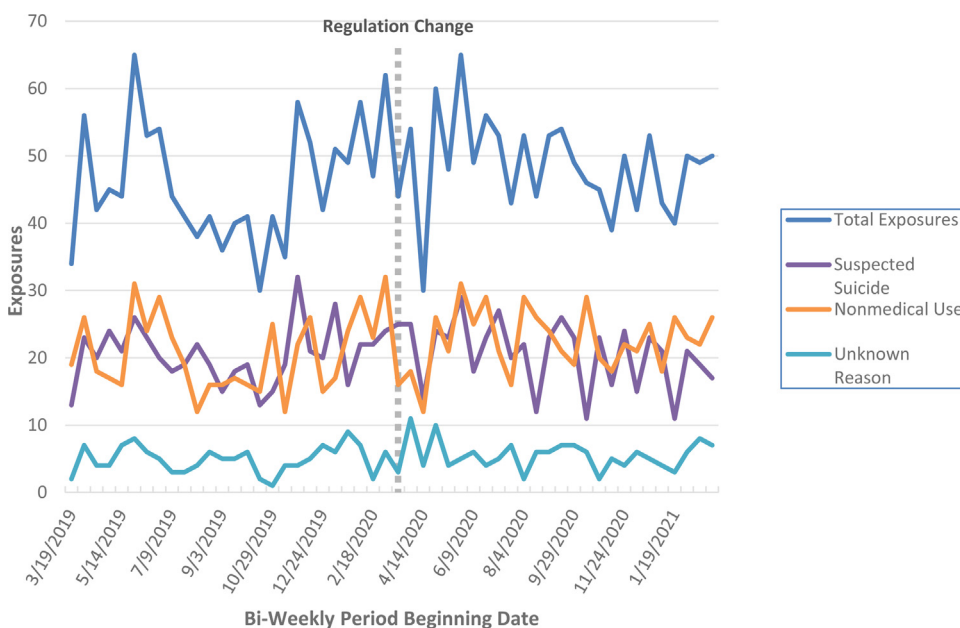
Fig. 1. Intentional exposures involving methadone.

The determination of intentional vs unintentional is made by the SPI making an assessment based on the information provided by the caller or the health care provider. Intentional exposures are defined as exposures resulting from purposeful action. These exposures are further classified as: Abuse- exposure resulting from the intentional improper or incorrect use of a substance where the patient was likely attempting to gain a high, euphoric effect or some other psychotropic effect, including recreational use of a substance for any effect; Misuse- exposure resulting from intentional improper or incorrect use of a substance for reasons other than the pursuit of psychotropic effect; Suspected Suicide or Unknown. Abuse and misuse were grouped together under non-medical use for the purposes of this study.