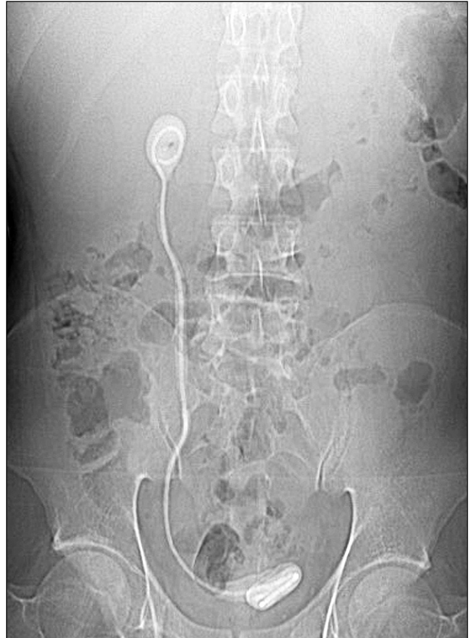
Figure 2. Plain X-Ray showing stent encrustation.

A number of classification systems now exist in endourology, which includes validated tools for SE [23]. This includes the Forgotten Encrusted CALcified (FECal) system, which categorises SE cases into 5 levels from minimal encrustation of a coil (Level 1) to encrustation of the entire stent length (Level 5) [24]. It is the original and most used tool of this kind, which can aid operative planning including the need for a multimodal treatment strategy. A similar tool is the Kidney, Ureter, Bladder (KUB) system, which also gives indication of patients requiring prolonged